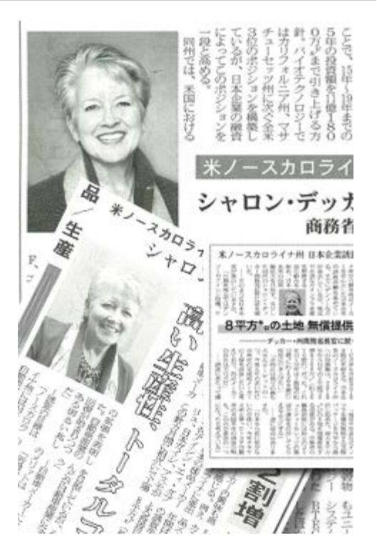
Clippings from recent Japanese newspapers