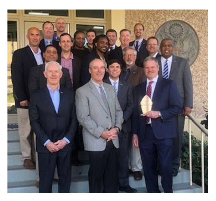
The North Carolina delegation to Botswana.