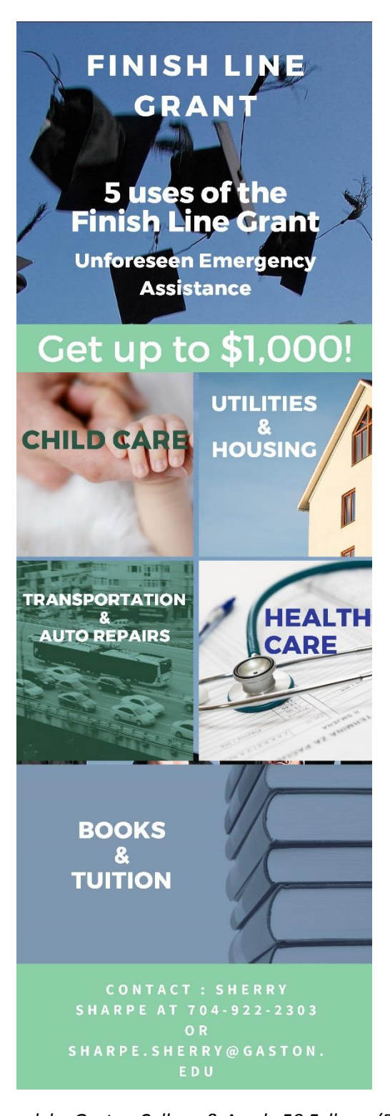
Bookmark by Gaston College & Awake58 Fellows (BACK)