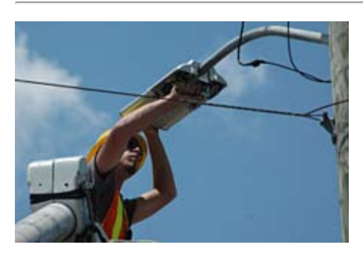
Installation of 900 LED street lights in Asheville's River District and Kenilworth began in May, 2011.

N.C. Department of Commerce Secretary Keith Crisco speaks about Gen Z's impact on North Carolina's economic development in a video produced by the Institute for Emerging Issues. <u>See the video</u>. <u>Learn more</u>.