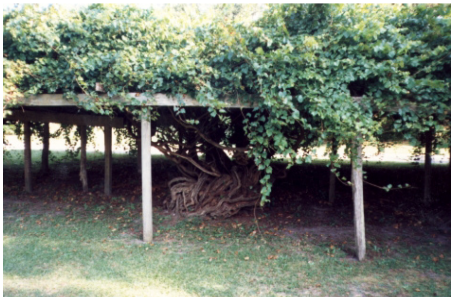
North Carolina's "Mother Vine," located on Roanoke Island, is the oldest cultivated Muscadine grapevine in America.

http://www2.ncommerce.com/eclipsfiles/18166.pdf