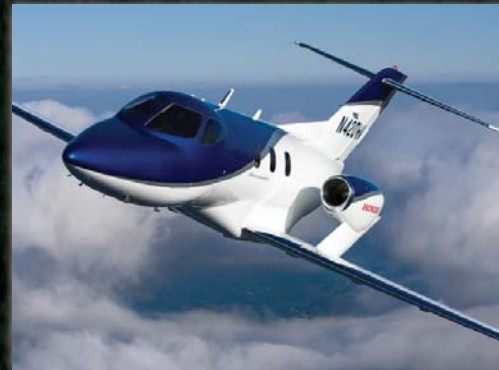
Greensboro and Burlington, North Carolina